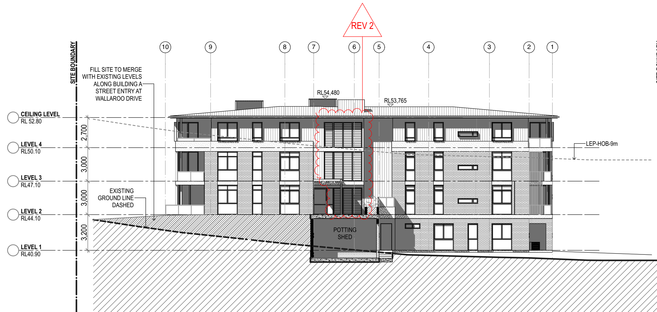
4 BUILDING A - EAST ELEVATION 1:200